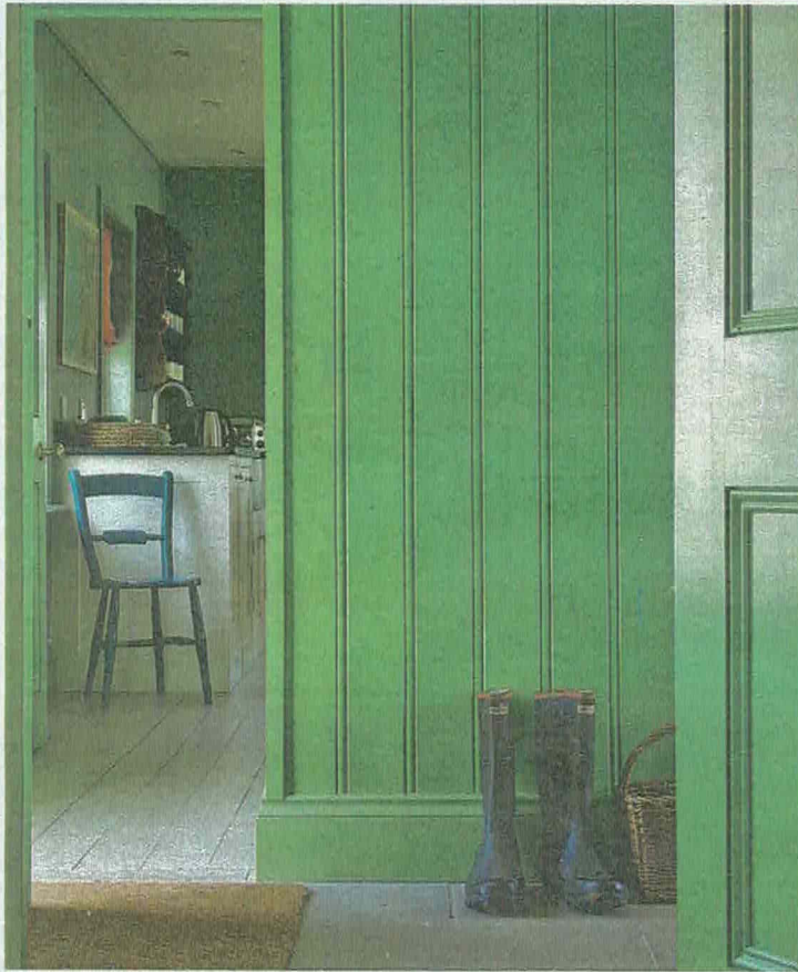
This Welsh farmhouse interior is by the architectural designer Ben Pentreath. The green paint is a discontinued Farrow & Ball colour, Saxon Green; the flooring at the front of the picture is in local Blue Pennant stone. pentreath-hall.com