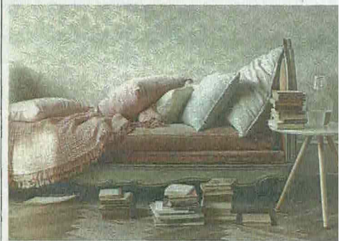
An elegant take on the botanical print, Fired Earth's Nara wallpaper is based on a Japanese fern motif. It comes in four colourways, including this cool grey and a vibrant green. Was £75 a roll, now £37.50; fireearth.com