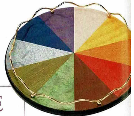
Rainbow Spectrum small lacquered tray, £300, Matilda Goad