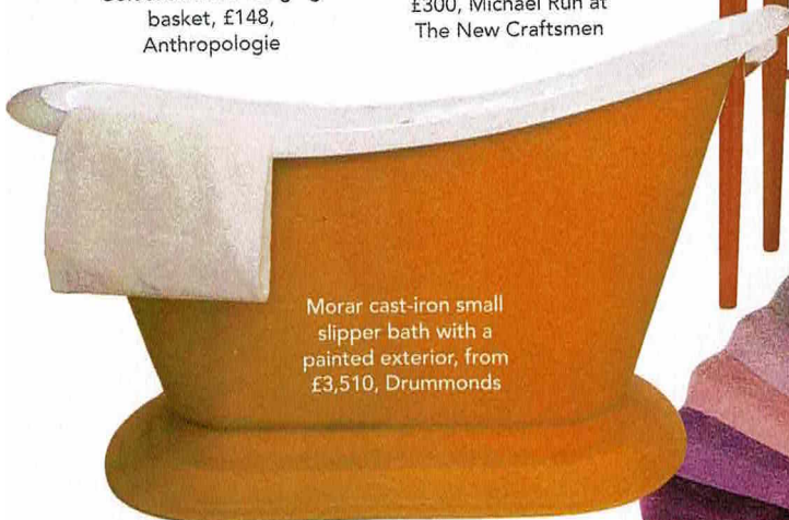
Morar cast-iron small slipper bath with a painted exterior, from £3,510, Drummonds