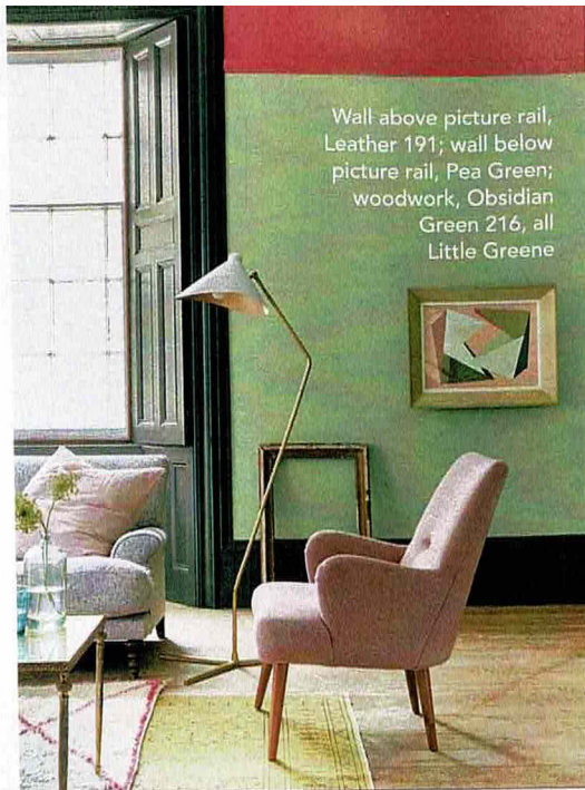
Wall above picture rail, Leather 191; wall below picture rail, Pea Green; woodwork, Obsidian Green 216, all Little Greene