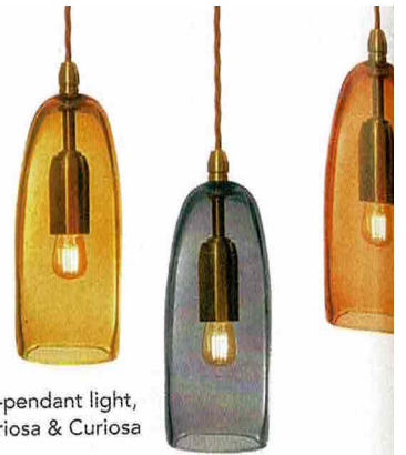
Tor three-pendant light, £425, Curiosa & Curiosa