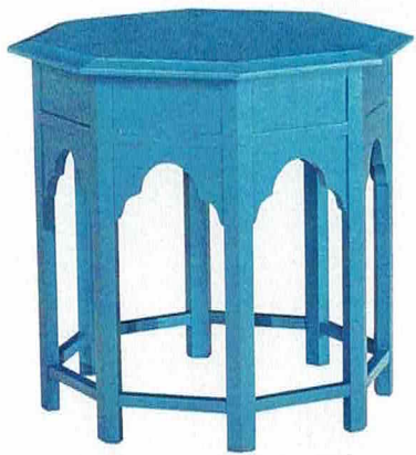
Tanjina side table in Peacock, £1,690, William Yeoward