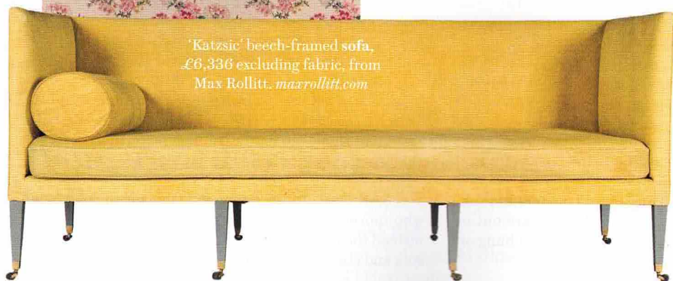
'Katzsic' beech-framed sofa, £6,336 excluding fabric, from Max Rollitt. maxrollitt.com