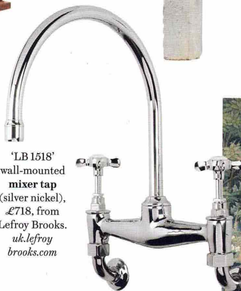
'LB 1518' wall-mounted mixer tap (silver nickel), £718, from Lefroy Brooks. uk.lefroybrooks.com