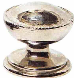
'Trafalgar' brass cabinet handle (antique silver), £110, from Collier Webb. collierwebb.com