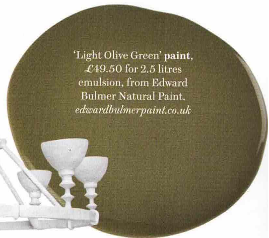
'Light Olive Green' paint, £49.50 for 2.5 litres emulsion, from Edward Bulmer Natural Paint. edwardbulmerpaint.co.uk