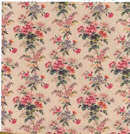
'Palmyre' (original), by Le Manach, cotton, £218 a metre, from Pierre Frey. pierrefrey.com