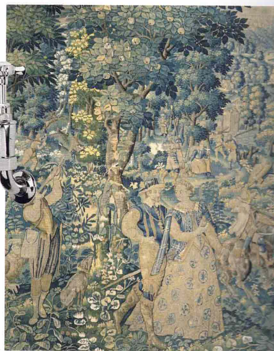
'Dalliance' linen wall hanging based on a 17th-century tapestry, 160 x 130cm, £1,250, from Zardi & Zardi. zardiandzardi.co.uk